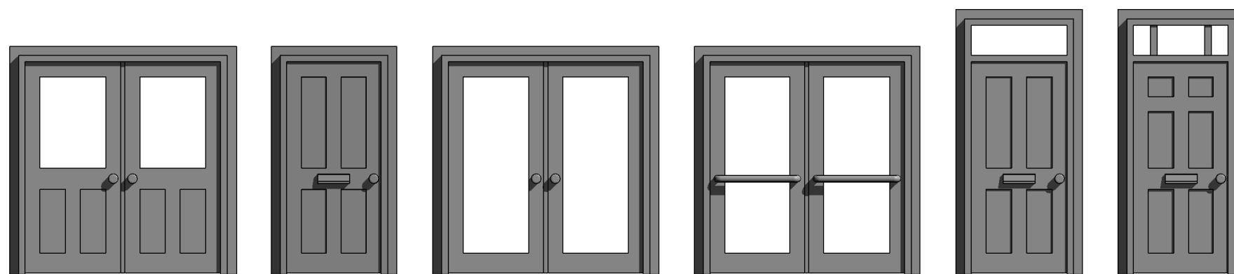
Type 11 Type 12 Type 13 Type 14 Type 15 Type 16